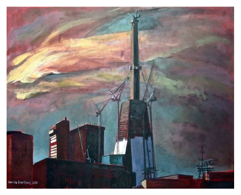
Where is the Thames?, 2011, oil on canvas, 62cm x 75cm